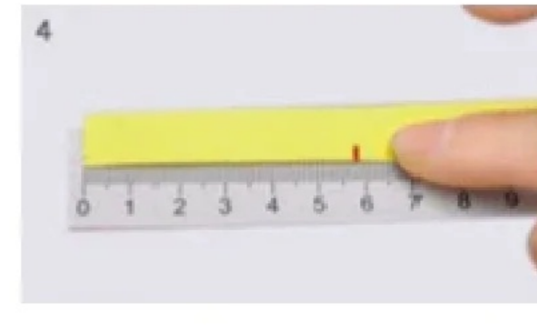
4 Measure length on a ruler from tip to pen mark.