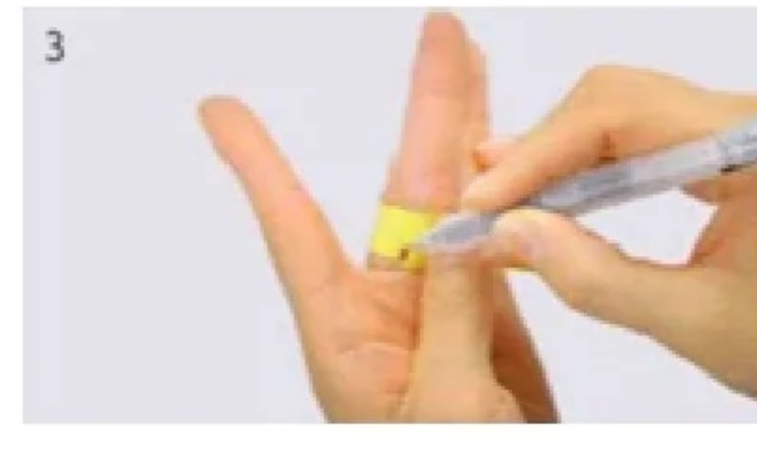
3 Mark with a pen where the two ends meet.