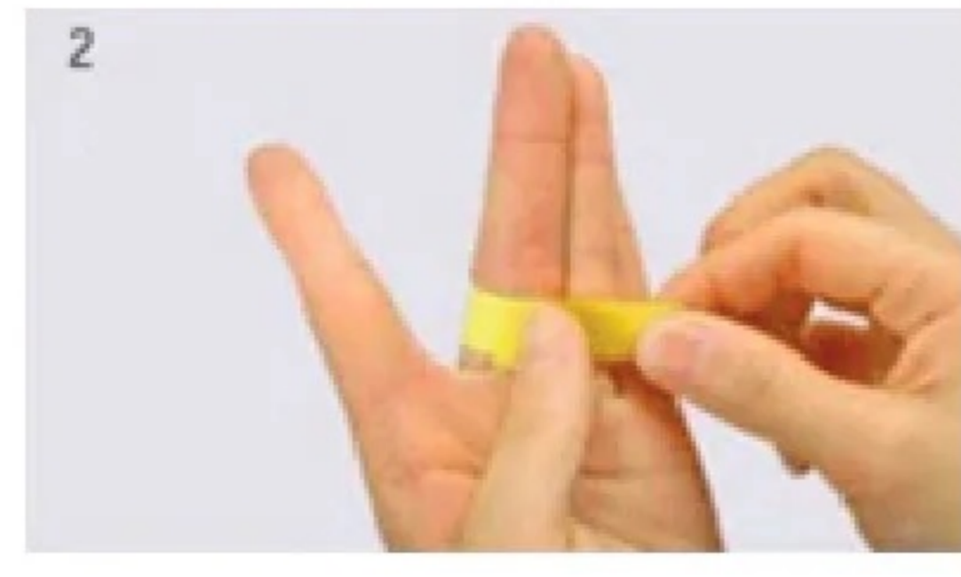
2 Wrap the paper around your finger. Make sure it's snug.