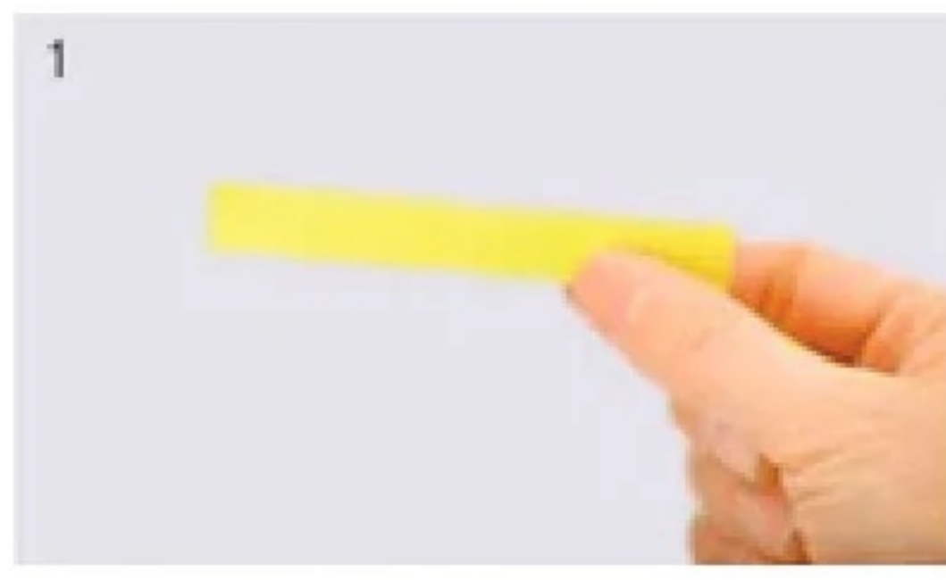
1 Cut a thin strip of paper.